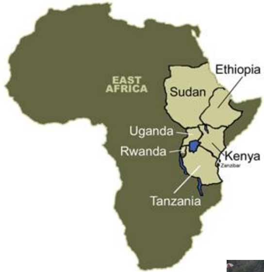
Nairobi Capital of Kenya