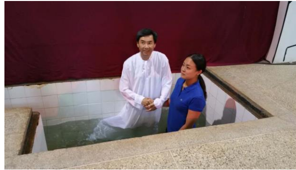
Baptized 4 so far