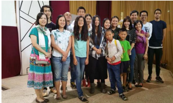
About 18 regular members