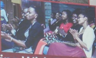
Connecting With People